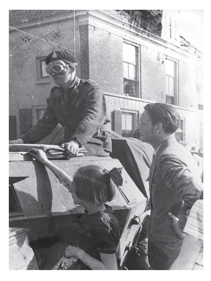
Group Commander sitting in a personnel carrier – Liberation of Holland photo collection

In total, approximately 730,000 men and women served in the Canadian Army during the Second World War. During six years of war, the Canadian Army served in multiple theatres including the Pacific, Mediterranean, Italy, Northwest Europe, the defence of Britain, Iceland, Canada, and other smaller theatres of war. The Canadian Army was a complex organization with multiple areas of specialization including infantry, artillery, armoured, engineers, service corps, medical, ordnance, postal, and intelligence, etc.