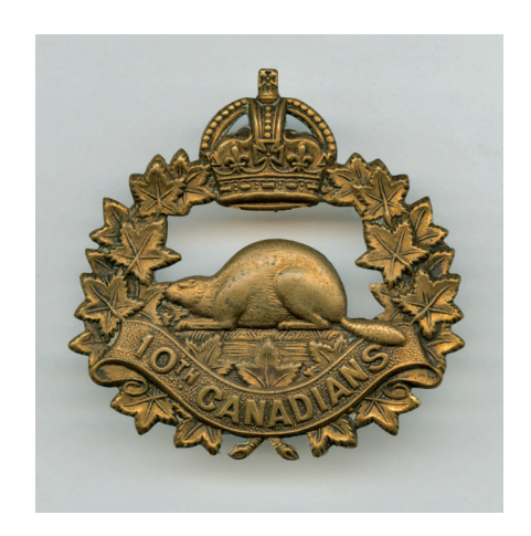
Cap Badge of the 10th Canadian Infantry Battalion