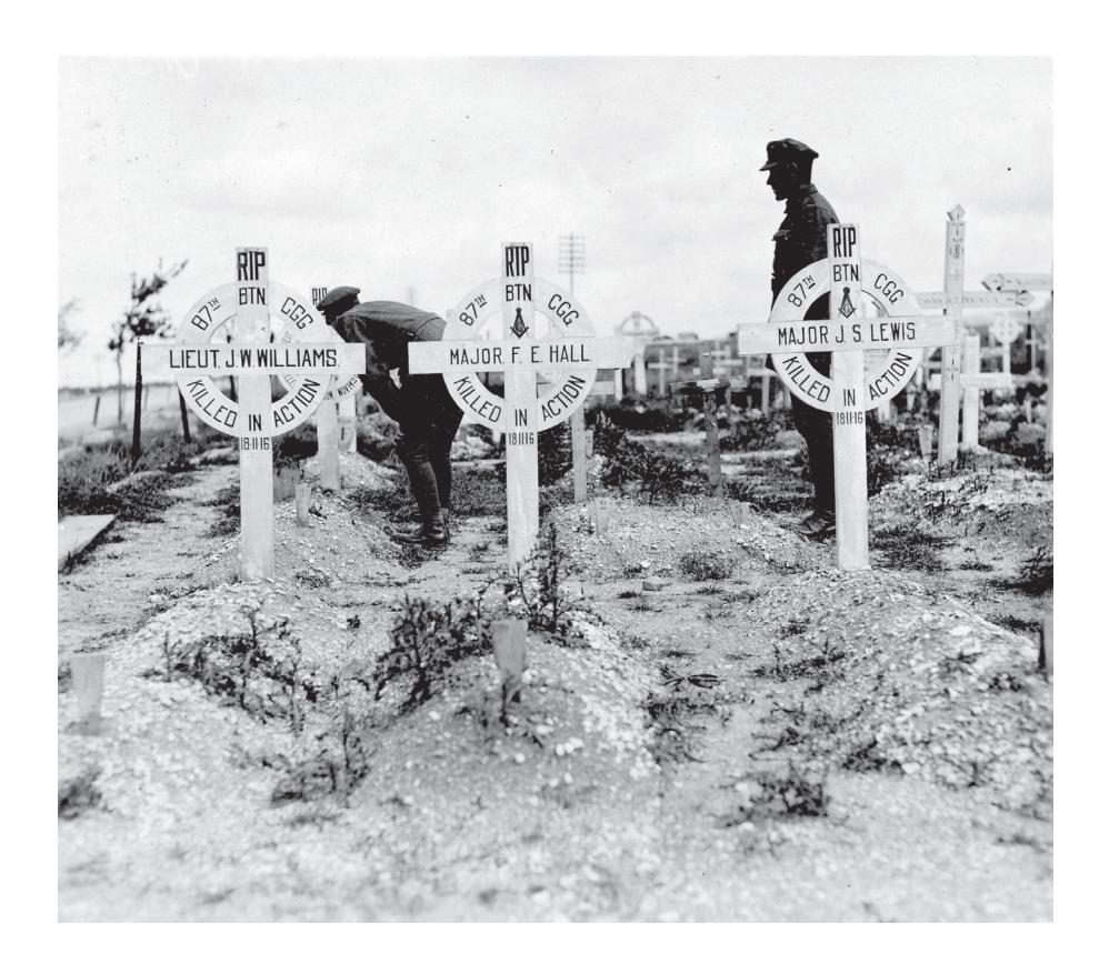
Canadian graves on the Albert Bapaume Road

through the <u>Commonwealth War Graves</u> <u>Commission</u>, the organization responsible for First and Second World War graves and monuments. At LAC, documentation for specific time periods includes the Circumstances of Death and War Graves Registers, and Veterans Death Cards.